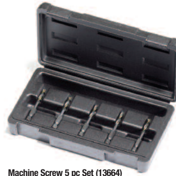
Machine Screw 5 pc Set (13664) Includes 6-32, 8-32, 10-24, 10-32, 12-24