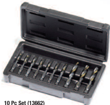
10 Pc Set (13662) Includes 6-32, 8-32, 10-24, 10-32, 12-24, 1/4-20, 5/16-18, 3/8-16, 7/16-14, 1/2-13