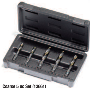
Coarse 5 pc Set (13661) Includes 1/4-20, 5/16-18, 3/8-16, 7/16-14, 1/2-13