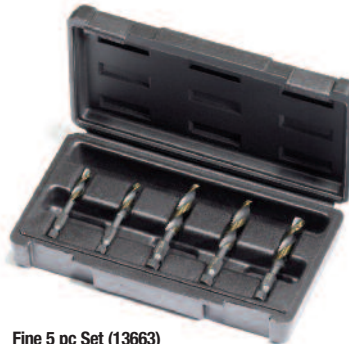
Fine 5 pc Set (13663) Includes 1/4-28, 5/16-24, 3/8-24, 7/16-20, 1/2-20