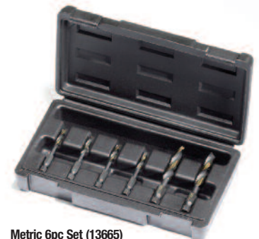
Metric 6pc Set (13665) Includes M4x.7, M5x.6, M6x1, M8x1.25, M10x1.5, M12.1.75