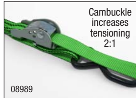
Cam buckle increases tensioning 2:1