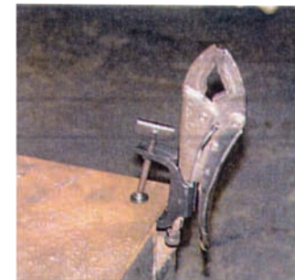
OMNIUM GRIP PLIERS