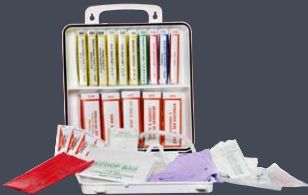
Safety Plus Kit