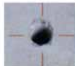
Booster Plus bit